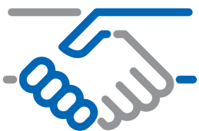
EMPHASIS ON FIRST CORE VALUES