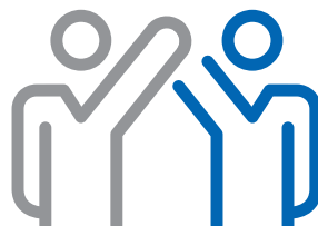
CULMINATING CELEBRATION WHERE STUDENTS CAN SHOWCASE WHAT THEY CREATED AND LEARNED